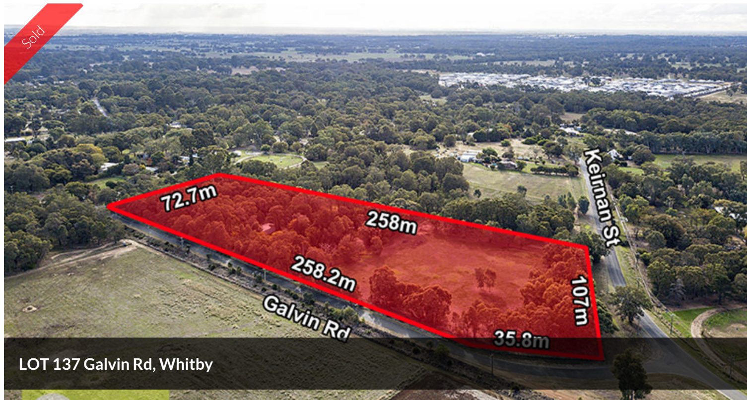
LOT 137 Galvin Rd, Whitby