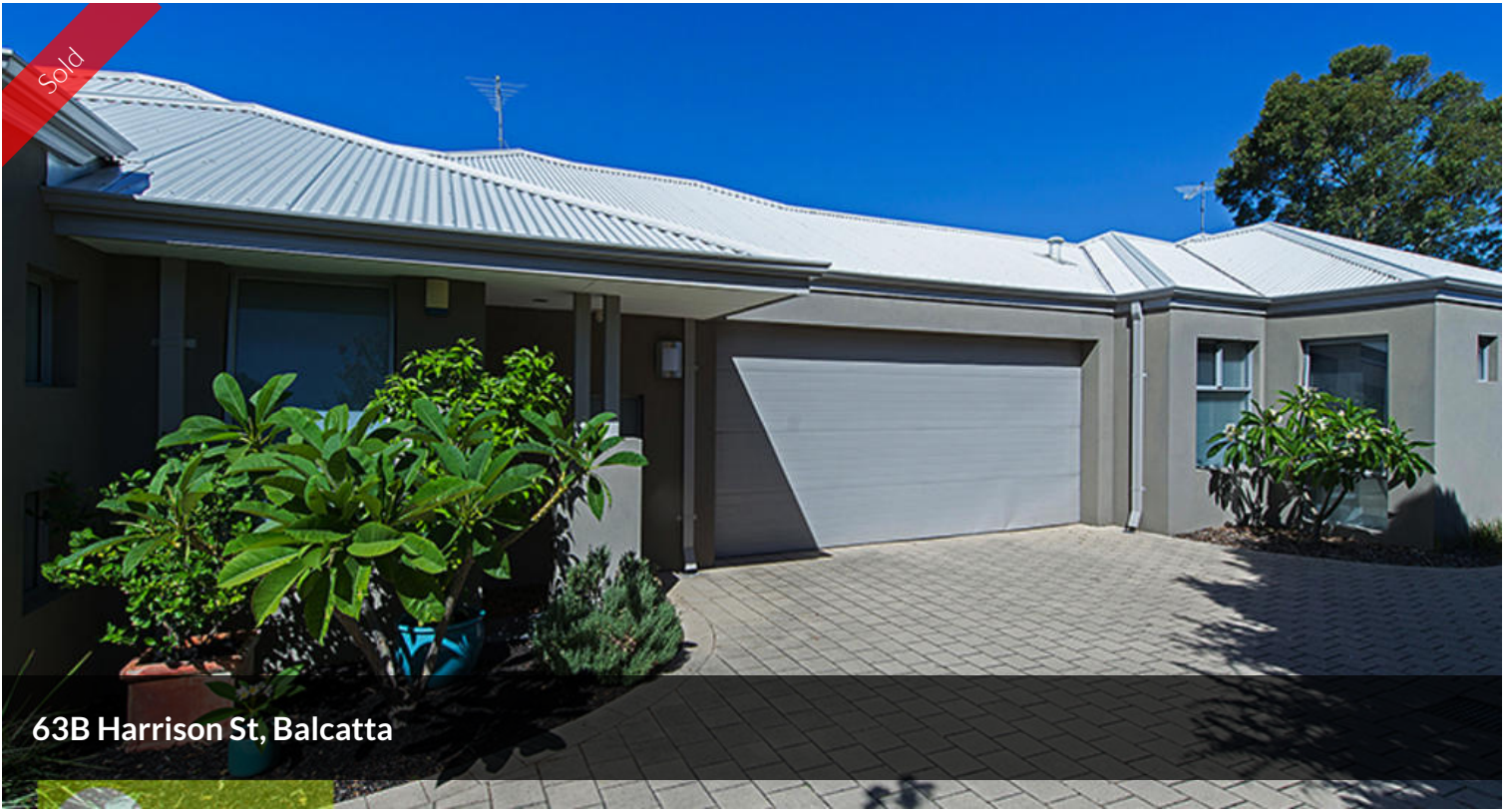
63B Harrison St, Balcatta