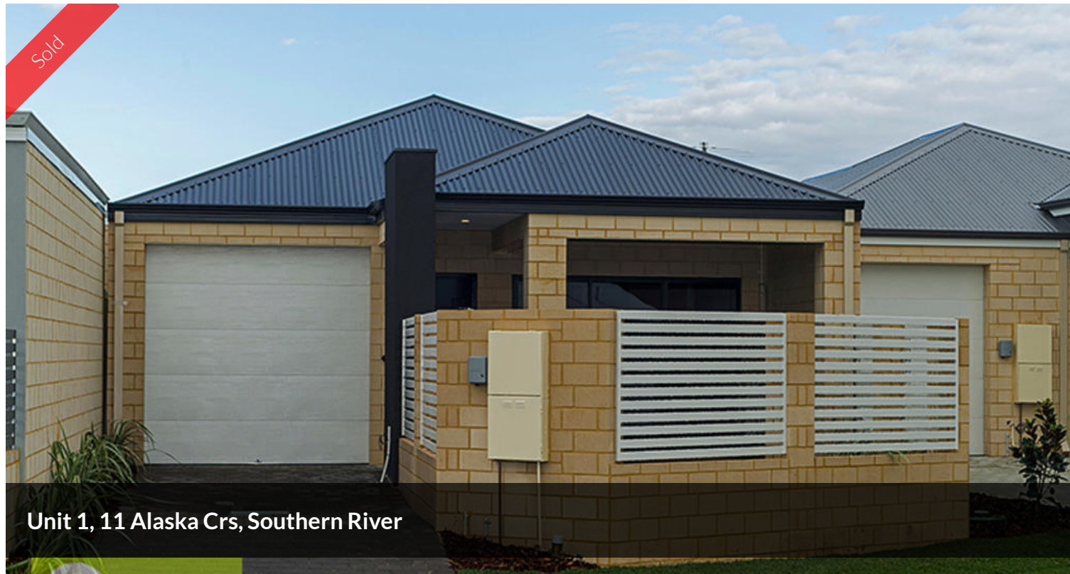
Unit 1, 11 Alaska Crs, Southern River